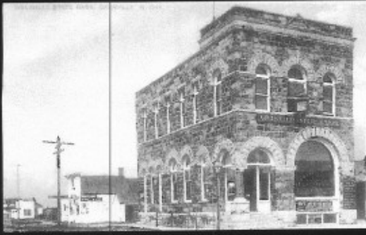
GRANVILLE STATE BANK - BUILT 1903