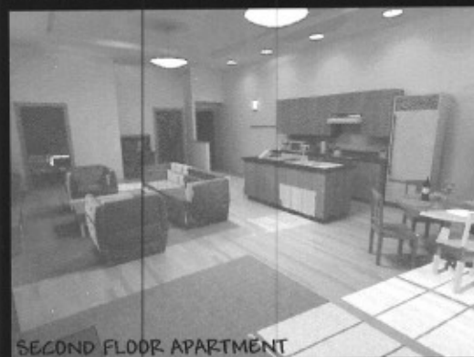
SECOND FLOOR APARTMENT