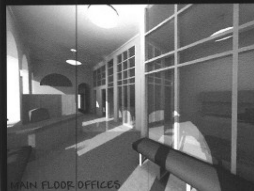
MAIN FLOOR OFFICES