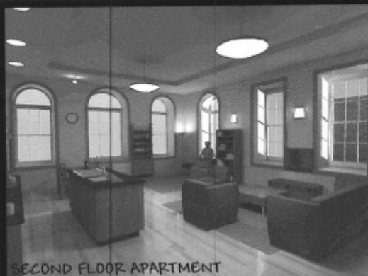
SECOND FLOOR APARTMENT