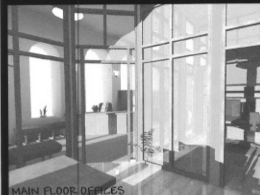
MAIN FLOOR OFFICES